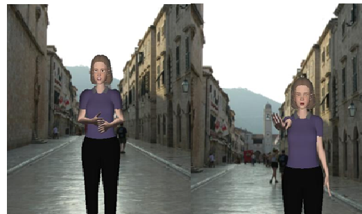
Figure 1. Interface of the ECA based tour guide system

The advancement of traffic makes world more and more internationalized and increases frequency of communication between people who come from different cultures. Differences in their conversation go beyond the languages they speak to the non-verbal behaviors they express while talking. To improve the abilities of the embodied conversational agents (ECAs) while interacting with human users we are working on the ECA based application, a tour guide of city Dubrovnik that servers visitors in Japanese, Croatian and English. A tour guide system is proposed as a project under the title "An Agent Based Multicultural User Interface in a Customer Service Application" during the period of the eINTERFACE '06 workshop [1]. eINTERFACE '06 belongs to series of workshops on the multimodal interfaces and was held during the four-week period of the summer 2006 in the city of Dubrovnik. The aim of eINTERFACE workshops is to establish a tradition of collaborative, localized research and development work by gathering a group of researchers during the one-month period. Our project had involved 6 students and 3 senior leaders. During the relatively short-term period we had developed an ECA based tour guide application of the venue of the workshop, Dubrovnik city, specified as a UNESCO Worlds Heritage