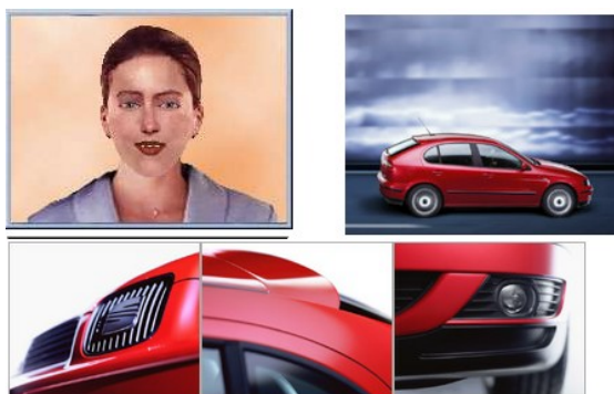
Figure 4. Virtual sales representative presenting a car model

Similar approach can be employed for sales. Instead of just showing an image of the product and main information, a virtual salesperson simultaneously provide a “sales pitch” and answer any additional question the potential buyer may have. Alternatively, the customer can ask for a tour of the product, obtaining a rich audio-visual experience with the virtual sales representative explaining the qualities of the product while at the same time showing appealing images, as the example in Figure 4 shows.